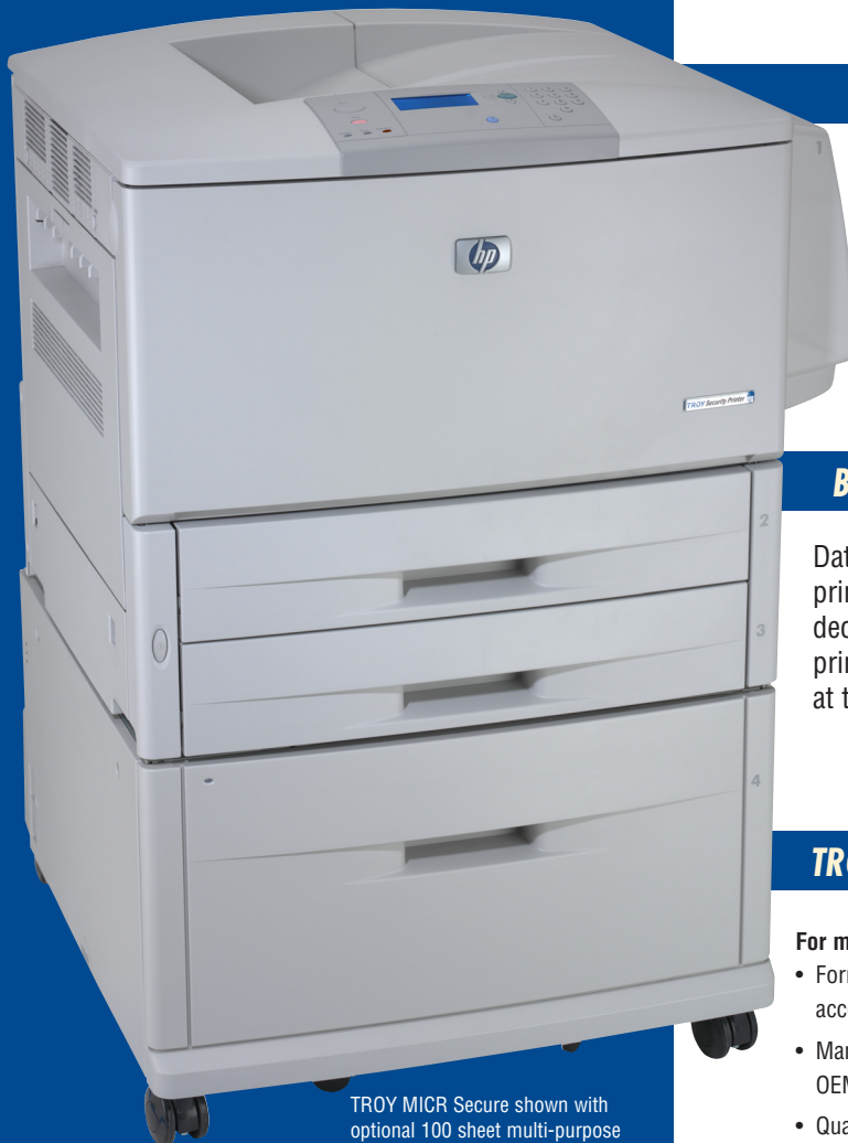
TROY MICR Secure shown with optional 100 sheet multi-purpose tray and 2,000 sheet input tray.